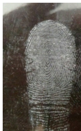
Figure 7: Development of Latent Fingerprint with the help of ophthalmic fiber glass powder on Metallic surface.