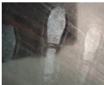
Figure 2: Development of Latent Fingerprint with the help of ophthalmic fiber glass powder on Glass surface.