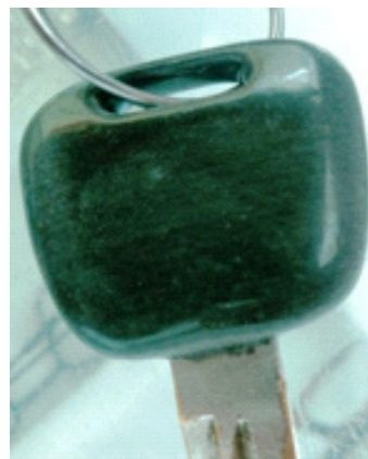
Figure 8: Development of Latent Fingerprint with the help of ophthalmic fiber glass powder on Car key (hard rubber) surface.