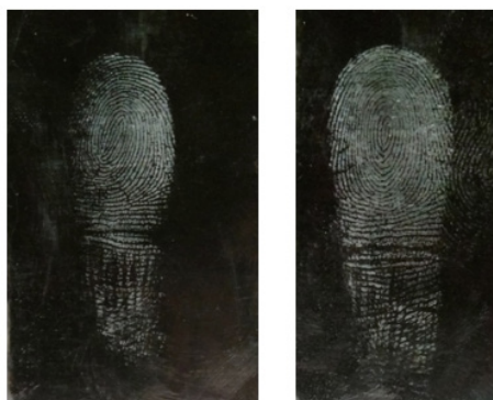
Figure 4 (a) and (b): Development of Latent Fingerprint with the help of ophthalmic fiber glass powder on Plastic surface.