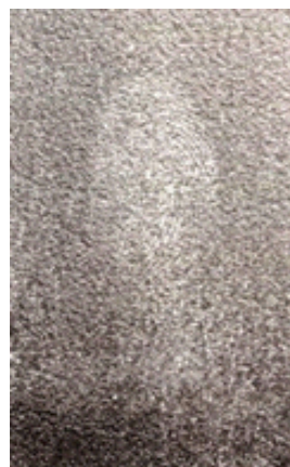
Figure 6: Development of Latent Fingerprint with the help of ophthalmic fiber glass powder on Rough plastic surface.