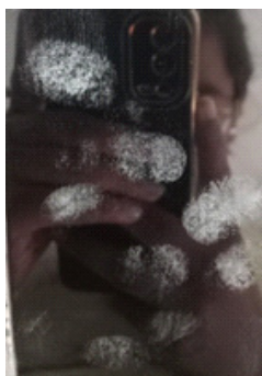
Figure 5: Development of Latent Fingerprint with the help of ophthalmic fiber glass powder on Mirror surface.