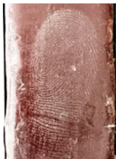
Figure 3: Development of Latent Fingerprint with the help of ophthalmic fiber glass powder on Oil-paint surface.