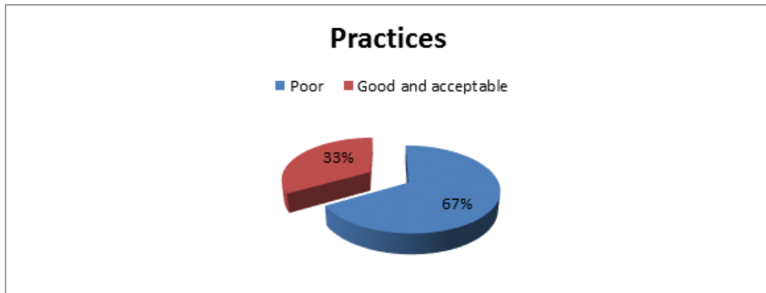
Figure 1 : Distribution of butchers by practices of food safety

The figure (1) represent the practices of butchers regarding food safety , The overall practices on food safety was poor. (67%) had poor practices of food safety while (33% ) had good practices.This finding is supported by Magda A. Latif et al (2014), who found the generally poor practices on food safety has been demonstrated in their study(17).