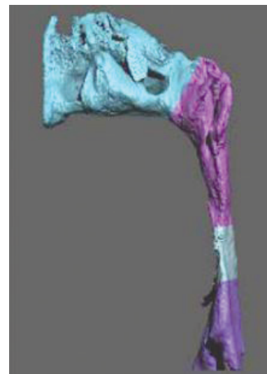
Figure 3: Three–Dimensional measurement of pharyngeal structures in malocclusion case (Class III)