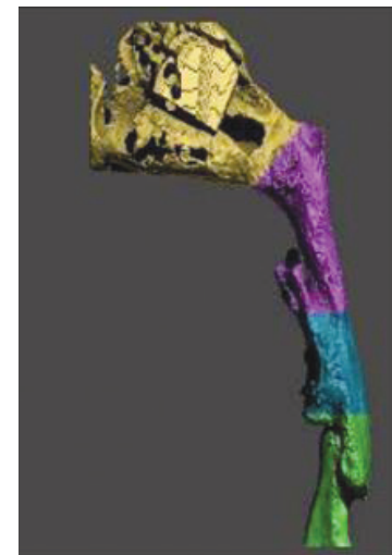
Figure 2: Three–Dimensional measurement of pharyngeal structures in malocclusion case (Class II)